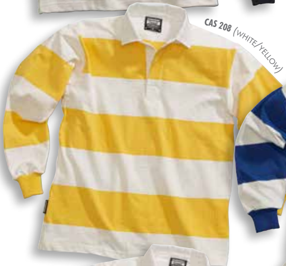
CAS 208 (WHITE/YELLOW)