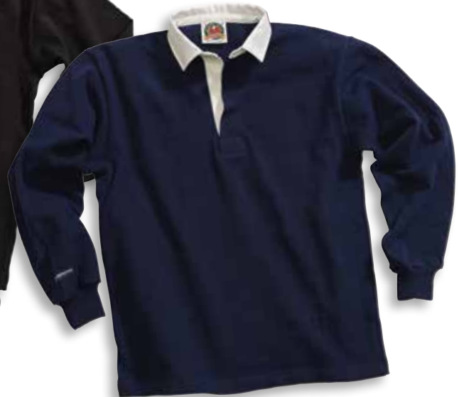
STK 018 (NAVY)