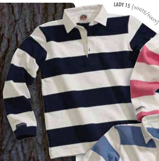
LADY 15 (WHITE/NAVY)