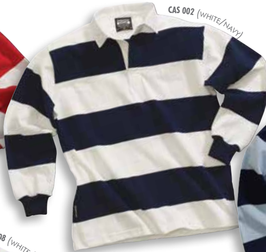
CAS 002 (WHITE/NAVY)