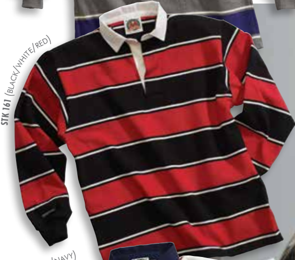
STK 161 (BLACK/WHITE/RED)