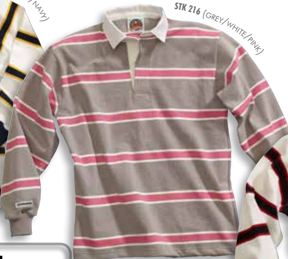
STK 216 (GREY/WHITE/PINK)