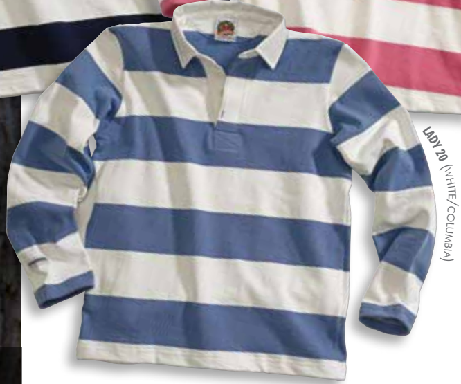
LADY 20 (WHITE/COUMBI) (W/NAVY)