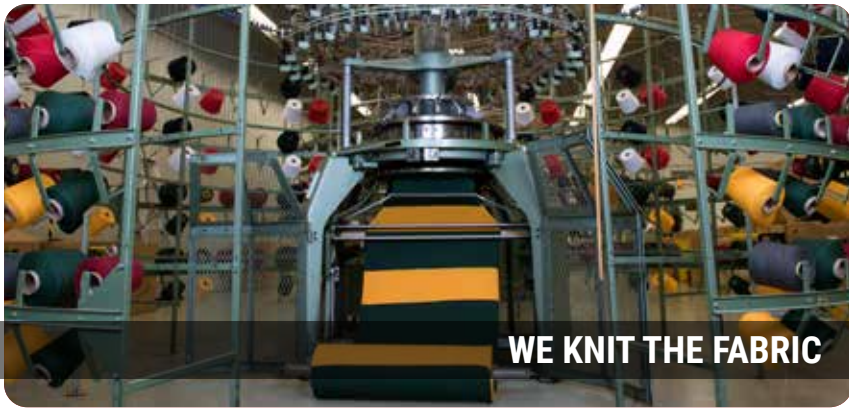
WE KNIT THE FABRIC