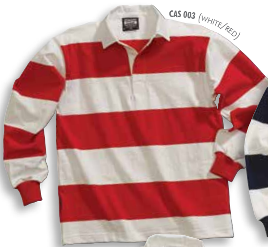
CAS 003 (WHITE/RED)