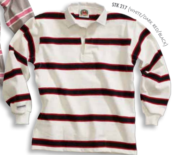
STK 217 (WHITE/DARK RED/BLACK)