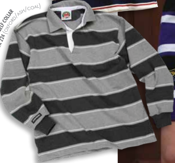
SELF-COLLAR STK 224 (OXFORD/ASH/COAL)