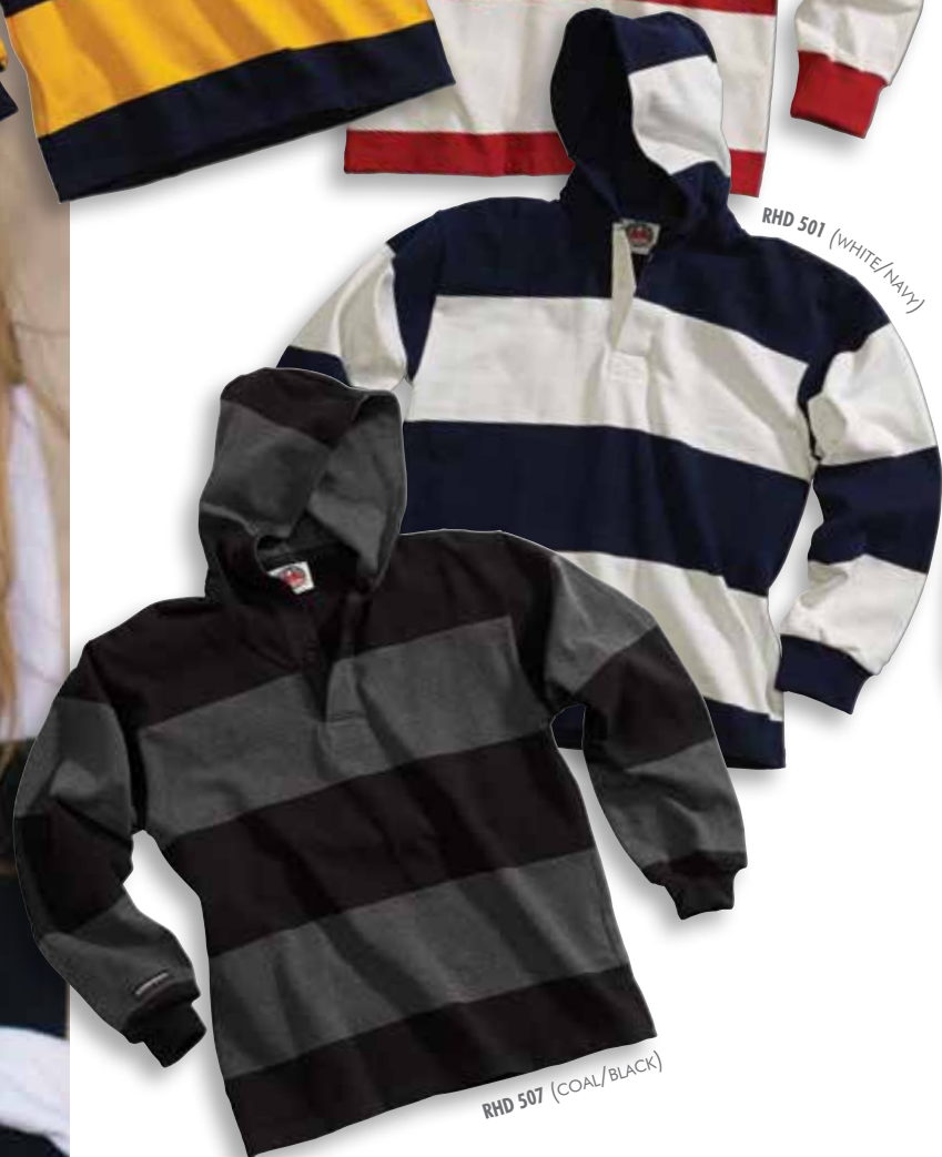
RHD 501 (WHITE/NAVY)