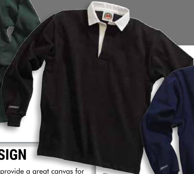
STK 037 (BLACK)