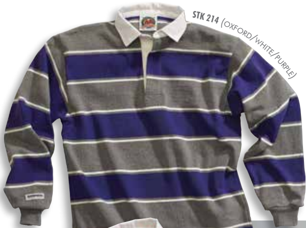
STK 214 (OXFORD/WHITE/PURPLE)