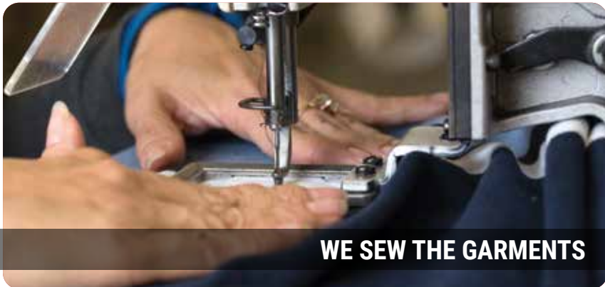
WE SEW THE GARMENTS