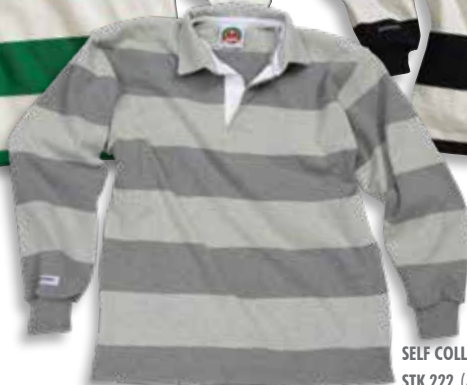
SELF COLLAR STK 222 (ASH/OXFORD)