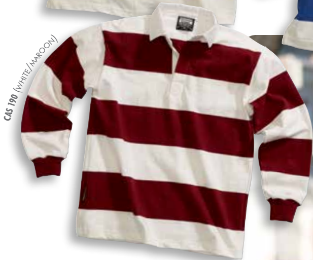
CAS 190 (WHITE/MAROON)

CASUAL 4 INCH STRIPE DESIGN Our most popular stripe pattern in our lighter-weight cotton, provides an ideal year-round alternative. Available in sizes XS - 3XL (Unisex)