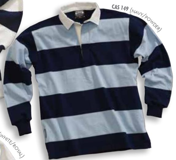
CAS 149 (NAVY/POWDER)