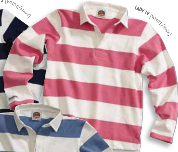
LADY 19 (WHITE/PINK)