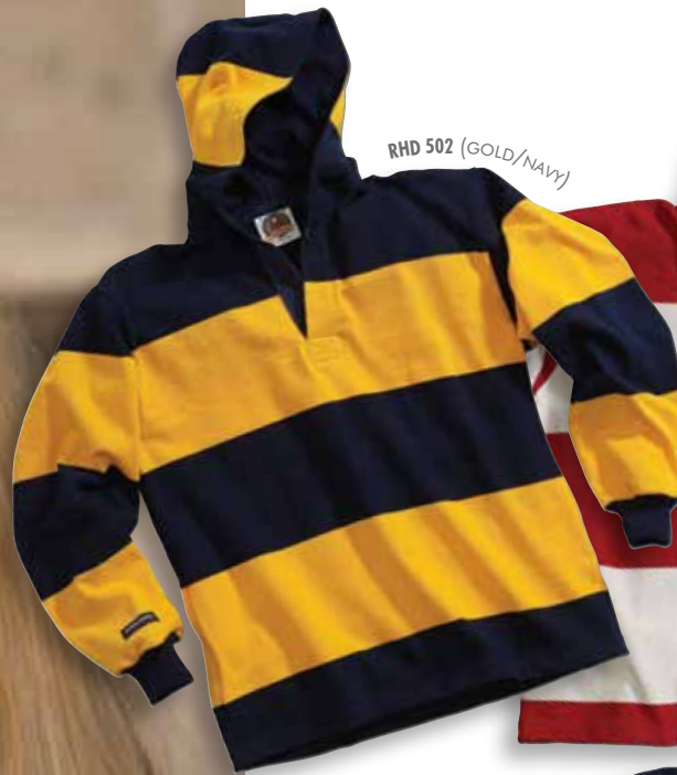
RHD 502 (GOLD/NAVY)