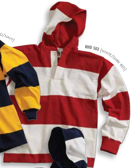
RHD 503 (WHITE/DARK RED)