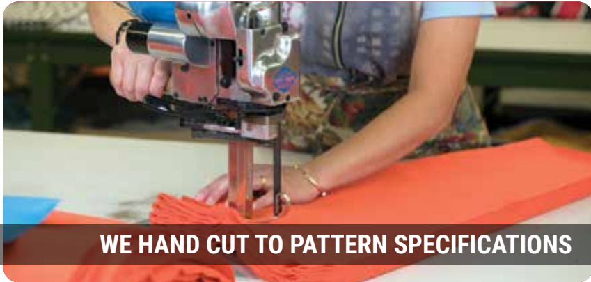
WE HAND CUT TO PATTERN SPECIFICATIONS