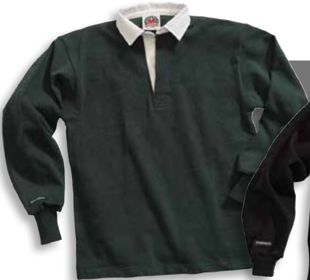
STK 038 (BOTTLE)