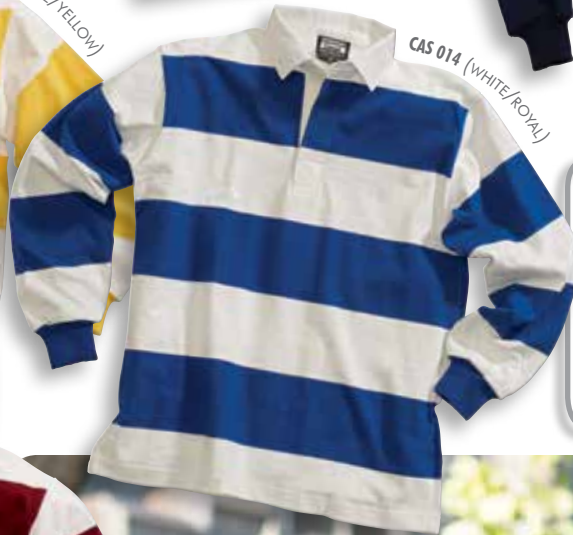
CAS 014 (WHITE/ROYAL)

CASUAL 4 INCH STRIPE DESIGN Our most popular stripe pattern in our lighter-weight cotton, provides an ideal year-round alternative. Available in sizes XS - 3XL (Unisex)