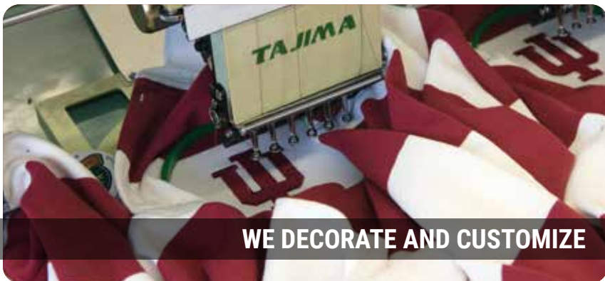
WE DECORATE AND CUSTOMIZE