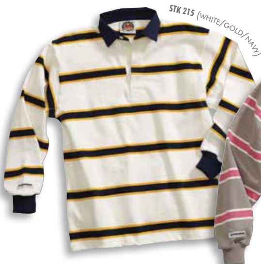
STK 215 (WHITE/GOLD/NAVY)

Niagara Design, Custom Custom Dress (pg 18), Kangaroo Hood (pg 11)