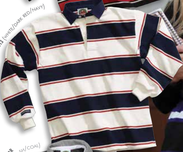
STK 213 (WHITE/DARK RED/NAVY)