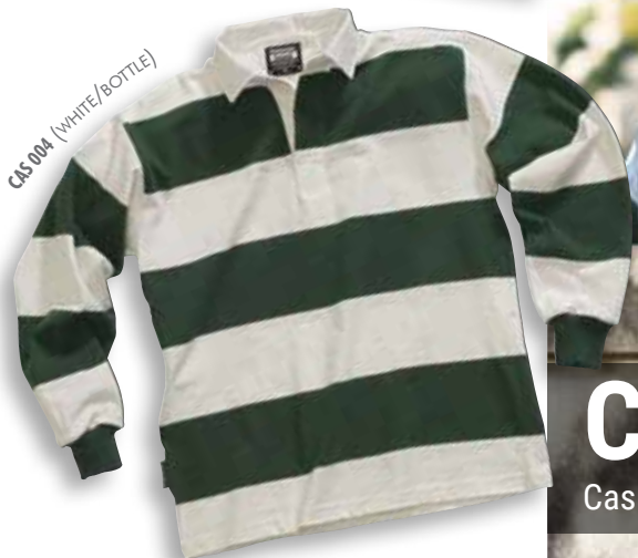
CAS 004 (WHITE/BOTTLE)