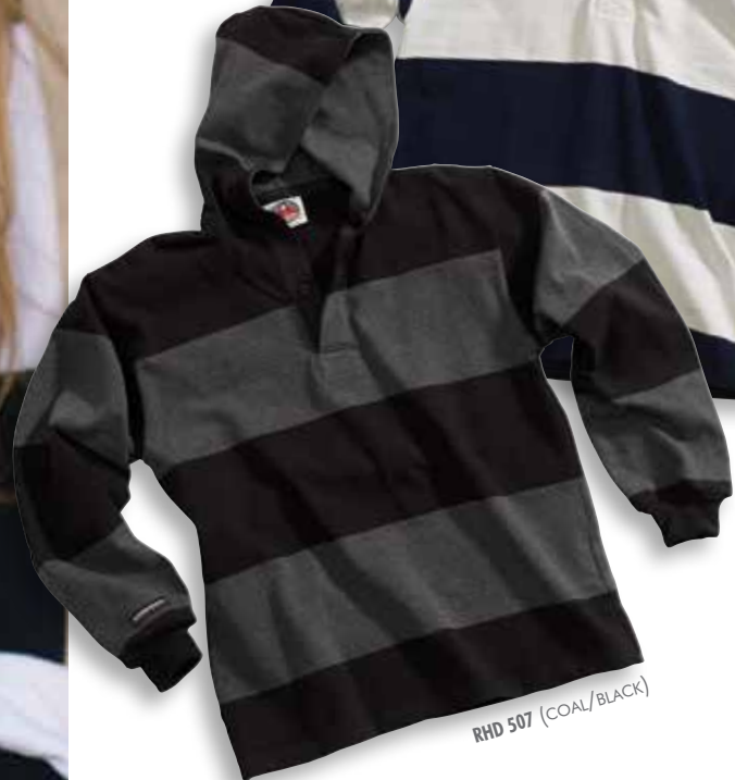
RHD 507 (COAL/BLACK)