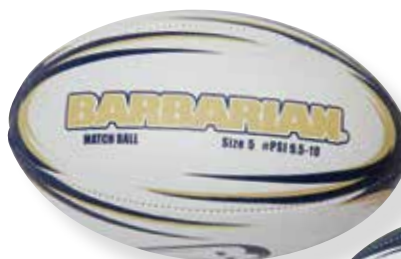
MATCH BALL Size 5 - BRB 5005 Barbarian Grain