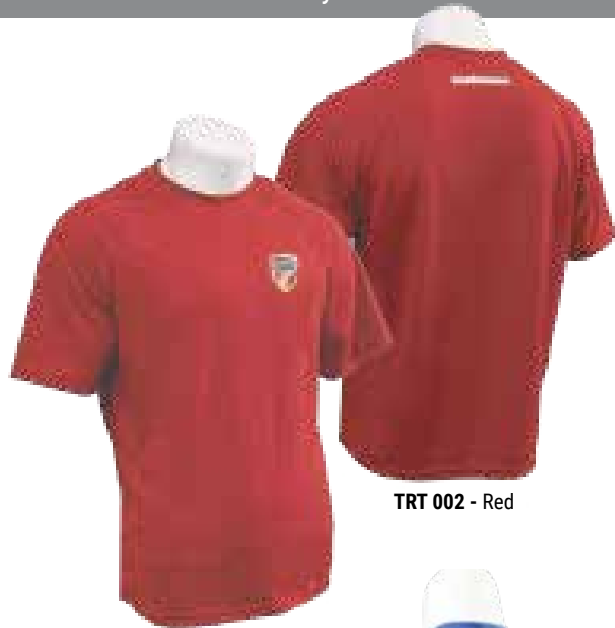
TRT 002 - Red