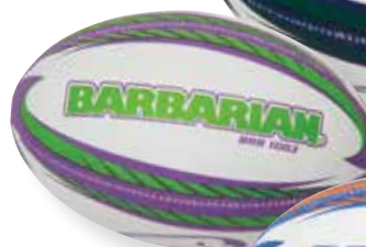
TRAINING BALL Size 3 - BRB 1003 Pin Grain