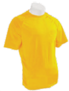
TRT 004 - Gold