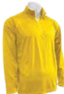
TRP 004 - Gold