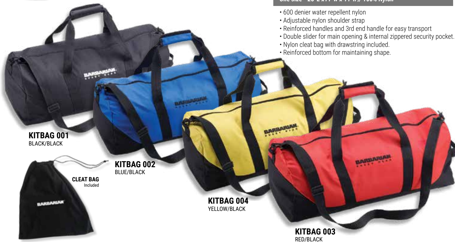
KITBAG 001 BLACK/BLACK