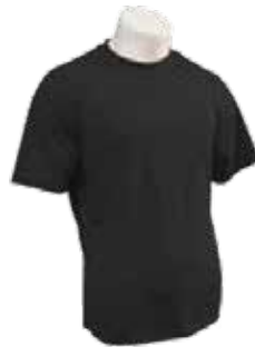
TRT 001 - Black