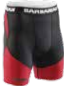
CMPR 003 Black/Red