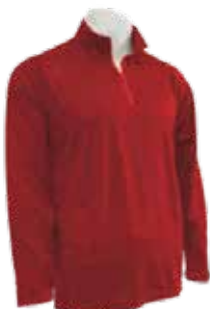
TRP 002 - Red