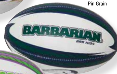
TRAINING BALL Size 5 - BRB 1005 Pin Grain