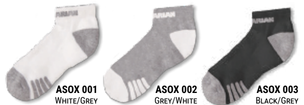
ASOX 001 WHITE/GREY