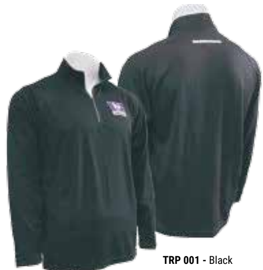
TRP 001 - Black