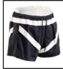
INSIDE OF SHORTS