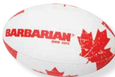
TRAINING PROMOTIONALBALL Size 5 - BRB 505 Pin Grain