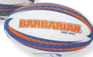
TRAINING BALL Size 4 - BRB 1004 Pin Grain