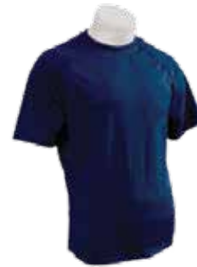
TRT 003 - Navy