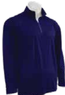
TRP 003 - Navy